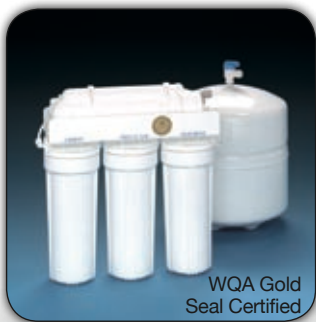
Goldline RO (#GOLDLINE 50)

Backwashing filters automatically deliver clean, clear water by removing iron, sulfur, chlorine, tastes, odors, tannins, nitrates, arsenic and many other contaminants.