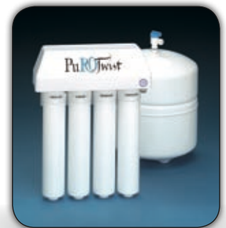
PuROtwist RO (#PT-4000)

Bottled-Water Quality for Taste, Health and Peace-of-Mind