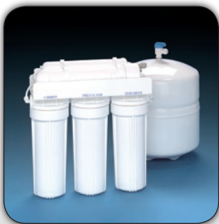
Goldline RO (#GOLDLINE 50)

Backwashing filters automatically deliver clean, clear water by removing iron, sulfur, chlorine, tastes, odors, tannins, nitrates, arsenic and many other contaminants.