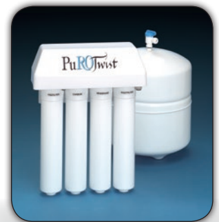
PuROTwist RO (#PT-4000)

Bottled-Water Quality for Taste, Health and Peace-of-Mind